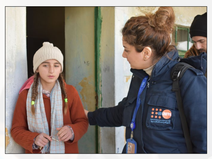
In Al-Qadmus town, in Syria's Tartus Governorate, UNFPA and partners carry out need assessment and provide psychosocial support and items to help with immediate needs, including warm clothes and personal hygiene products.