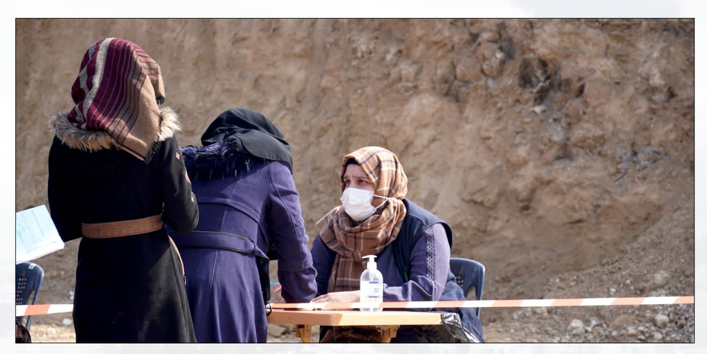
UNFPA delivers urgent aid to impacted communities in Idleb as part of a cross-border mission through Türkiye. In Northwest Syria, almost 3 million people were already internally displaced before the earthquake out of a total population of 4 million. Millions of Syrians live displaced in inferior shelter, braving winter conditions, and scarcity.