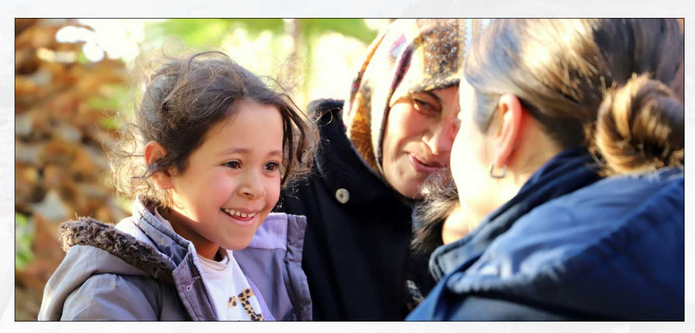
In Lattakia, Syria, a mother and her daughter receive a dignity kit at a temporary shelter following the devastating earthquakes. "I'm very grateful for this kit; it will help me a lot, as we need soap and shampoo. In the shelter, there are no hygiene supplies at all," the mother told UNFPA.