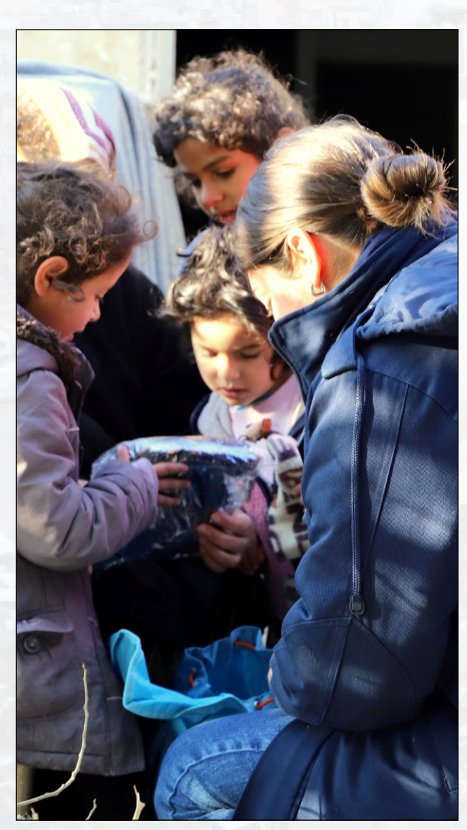
UNFPA's partner, the Syrian Family Planning Association, distributes dignity kits in two collective shelters in Lattakia following the devastating earthquakes.