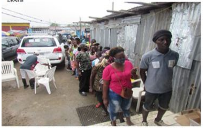
Disadvantaged youths awaiting service delivery during outreach activity in Goba Chop Community, Red-light

Socio Economic Empowerment of Disadvantaged (SEED) Youth Project in Liberia