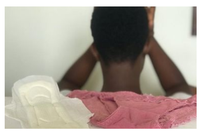
A young girl using a sanitary pad for the first time under the Because I want to Be Initiative.