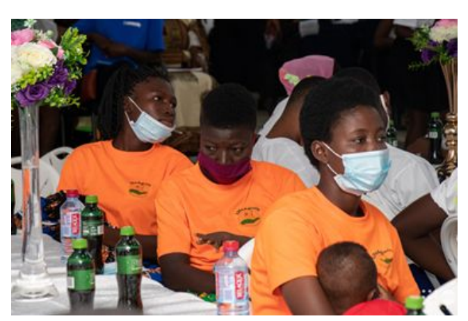
Life continues even after having a baby as an adolescent- The International Day of the Girl Child commemoration.