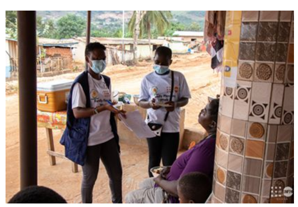
Young people engaging with the community during the door to door outreach on family planning.