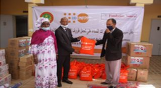
Official Donation Ceremony in the presence of the Gender Program Officer of UNFPA Mauritania.