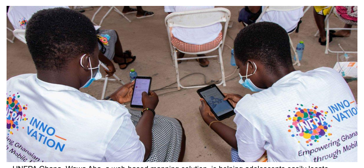
UNFPA Ghana. Wawa Aba, a web-based mapping solution, is helping adolescents easily locate nearby health facilities to access SRHR information and services.