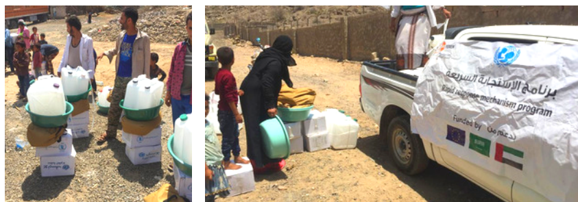
Distribution of RRM kits among displaced families in Al Dhale'e and Sana'a.