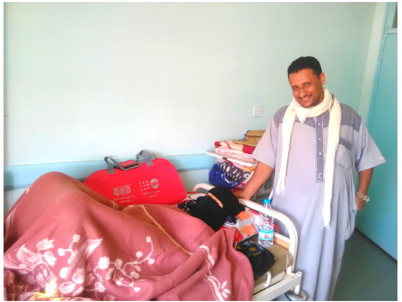
A woman who has undergone successful obstetric fistula operation with her husband at a UNFPA-supported fistula unit