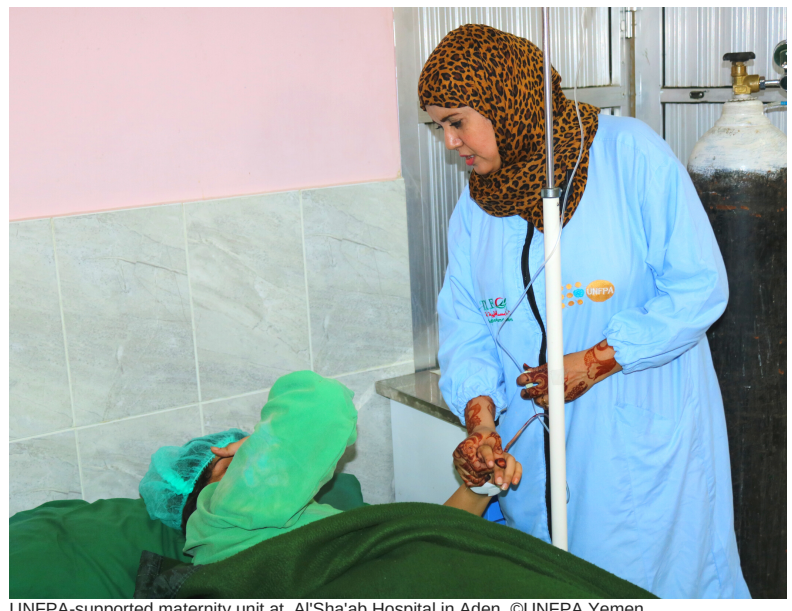
UNEPA-supported maternity unit at Al'Sha'ab Hospital in Aden