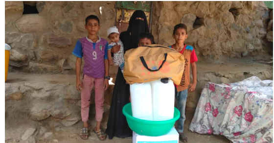
Displaced families with their RRM kits in Dhammar Governorate