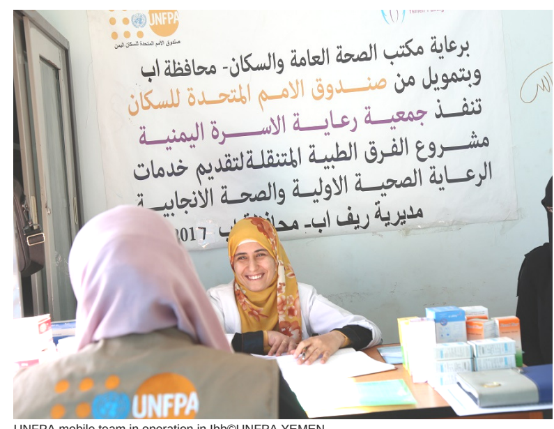
UNFPA mobile team in operation in Ibb