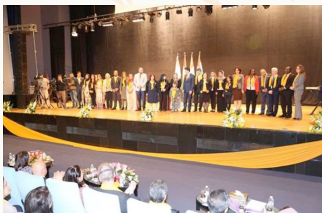
During the launch of the campaign in Erbil, Kurdistan region of Iraq.