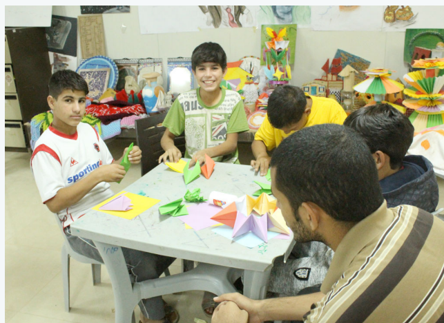
Youth participating in art activities at the UNFPA-supported youth centre in Zaatari camp.

A 60-year old Syrian woman in Egypt said that prior to attending activities at one of the UNFPA-supported women and girls safe spaces, "I was depressed and isolated. I did not interact with people as a result of the events I had experienced. Every one of my children lives in a different country and my husband passed away in Syria. After starting attending activities in the safe space, the situation has changed. I felt that many women were undergoing similar experiences, so this supported me. I also managed to express myself and share my struggles in front of others. Overall, it provided me with a non-judgmental and supporting environment."