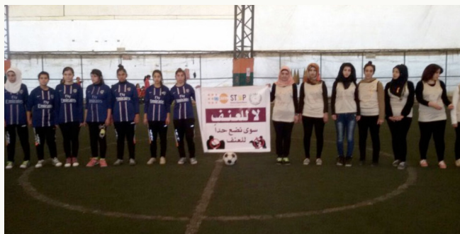
Women football teams in Syria participate in the 16 Days of Activism campaign in Syria.

"Last year alone, the Fund invested more than $93 million in the prevention of and response to gender-based violence and harmful practices in developing countries and in humanitarian crisis situations," Babatunde Osotimehin, UNFPA Executive Director.