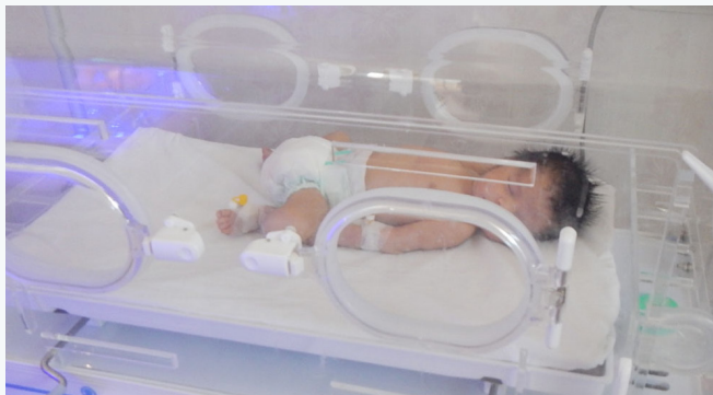
Newborn in incubator at Al Noor Hospital in Syria.

She spent three days in the hospital and was released in good health. In consideration of the patient's vulnerable condition, the hospital management provided her with food support and a new mother's kit and discharged her via ambulance.