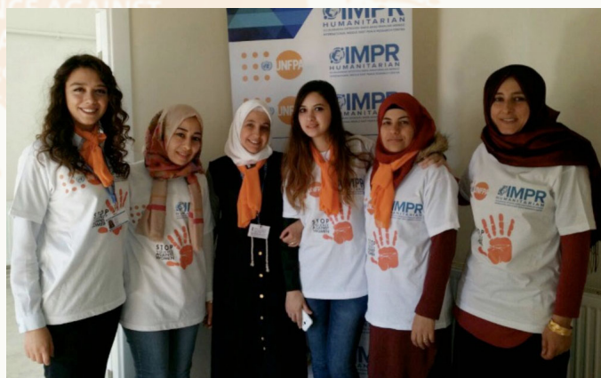
IMPR Humanitarian Kecioren Women's Community Center held raising awareness sessions with the support of UNFPA Turkey. #16DaysOfActivism.

"I attempted to commit suicide four times as I do not see a purpose for my life and do not want my daughter to see me as her role model. Upon accessing the safe space, I witnessed people interacting with each other and striving towards success, and this is when I realised that I can do the same thing," said a Syrian woman in Maadi women safe space in Egypt.