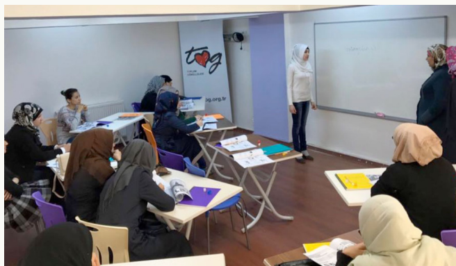
One of the SGBV awareness sessions in a youth centre in Diyarbakir, Turkey.

Economic problems faced by Syrian refugees still hinder them from reaching or participating in activities.