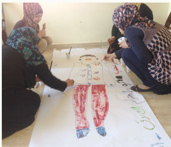
Syrian women during one of the psychosocial support sessions in a women's centre in Lebanon.

UNFPA co-chaired with the Ministry of Social Affairs the monthly national SGBV task force meeting where the indicators and targets of the 2017-2020 Lebanon crisis response plan framework were discussed.