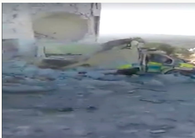
UNFPA-supported health facility in Idlib was hit by an air strike resulting in the injury of a number of health workers and a complete shut-down of the services.

The UNFPA cross-border team is expanding its capacity: the office finalised the recruitment process of a local programme associate and the incumbent joined the team as of the first of December. In the meantime, the recruitment process of a finance analyst is ongoing.