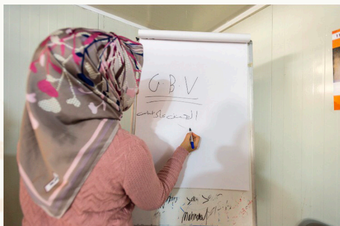
UNFPA Iraq provided 660 GBV services to Syrian refugees in November.

UNFPA country offices observed the 16 days of activism against gender-based violence through organising different activities to increase awareness on the impact of violence on women and girls.