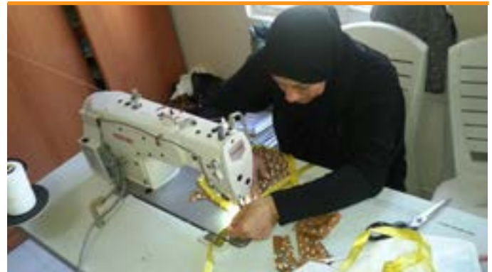
A Syrian woman participating in a sewing course supported by UNFPA in IMPR's women centre.