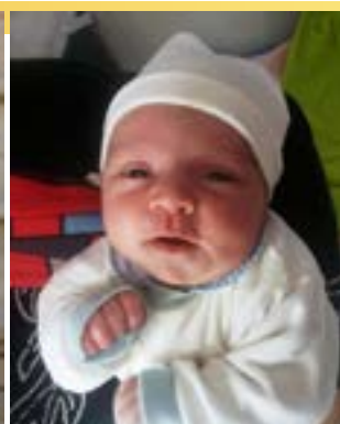
2015 | Obada | Baby # 3,000