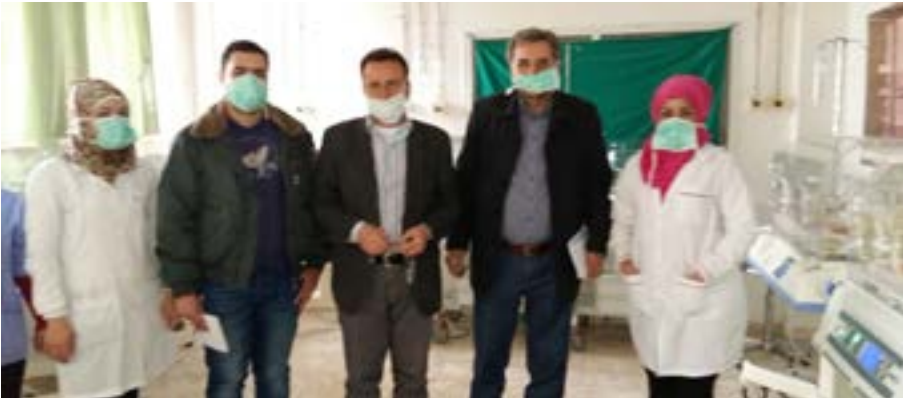
UNFPA staff in Al Hasakah during the mission to the health facilities.