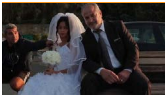
An outraged passer-by tries to get the young bride's attention during a staged photo shoot drawing attention to the issue of child marriage in Lebanon.