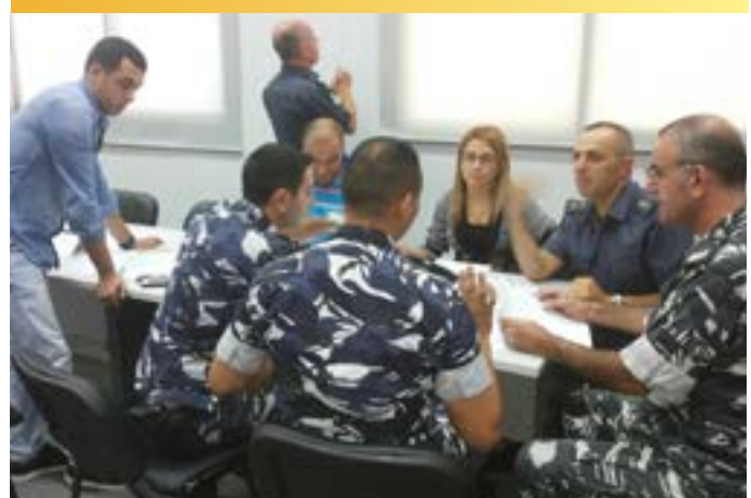
Stakeholders' meeting on reproductive health commodity security (RHCS) in Lebanon.

GENDER-BASED VIOLENCE OUTREACH: UNFPA distributed 2,946 dignity kits. Of these, INTERSOS distributed 36 kits to 185 beneficiaries attending a curriculum on photography training; Al-Mithaq distributed 110 kits to both Lebanese and Syrians attending problem solving sessions in random settlements of Syrian refugees and the village of Britel; and the International Orthodox Christian