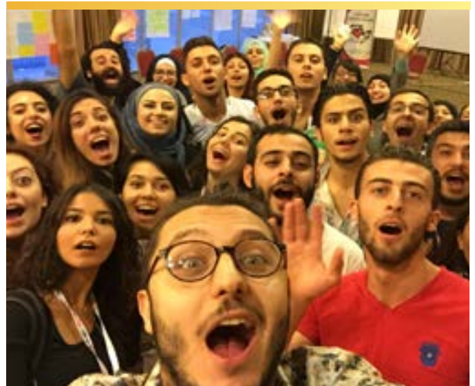
A training-of-trainers session supported by UNFPA on youth sexual and reproductive health in humanitarian settings in Hatay, Turkey.