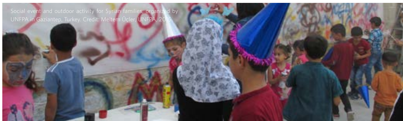
Social event and outdoor activity for Syrian families, organized by UNFPA in Gaziantep, Turkey.

RECREATIONAL ACTIVITIES: Recreational activities for 341 women and 43 girls were organized during the reporting period.