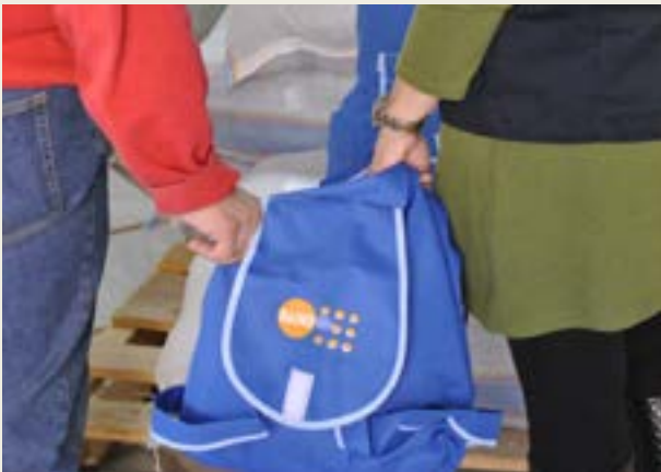
UNFPA distributing dignity kits to families in Rural Damascus, Syria.

Extensive shelling continued to be one of the most serious obstacles challenging the implementation of implementing partners' cross-border services inside Syria, another factor being preparation for winter, which has led to a decline in the number of women and girls accessing services in October. In fact, due to increased violence, two safe spaces have suspended activities, but will continue implementing activities in homes and schools.