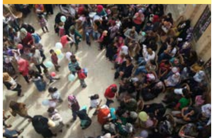
UNFPA's implementing partner Refugee Education Trust (RET) organized a social activity for Syrian refugees in the Gül Neighbourhood in Mardin, Turkey.

GENDER-BASED VIOLENCE OUTREACH: A total of 1,980 women and girls benefited from awareness raising on gender-based violence,