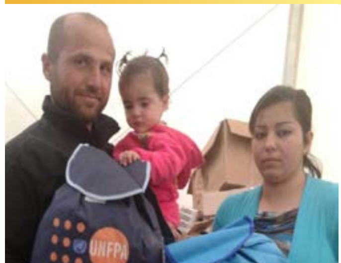
A big "thank you" from Qara, Deir Atiyah, and the Qalamun region (Damascus countryside)

A lawyer recruited by Al-Mithaq for provision of legal advice to women at risk of or victims of gender-based violence provided eight legal consultations during the reporting period.