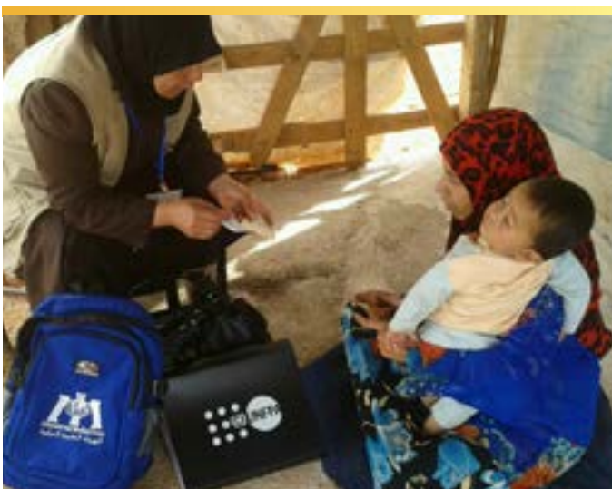
UNFPA through the IMC community health worker provided one-to-one counseling on family planning to a Syrian woman in an informal tented settlement in Central Bekaa, Lebanon.

REPRODUCTIVE HEALTH AWARENESS ACTIVITIES: In Damietta, 10 sessions were organized for 117 women and nine sessions for 218 girls. The sessions focused on topics including sexual and reproductive health, first aid, and life skills training. These topics were decided on prior needs assessment carried out by trainers and Syrian community health workers.