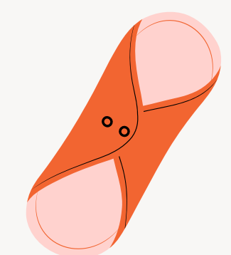
Reusable menstrual Pads