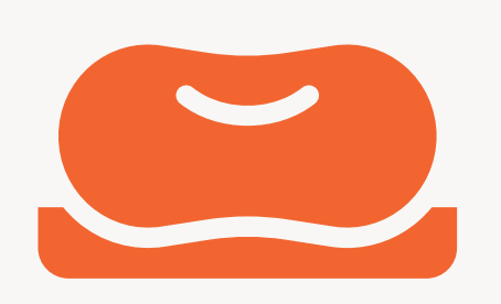
Bath soap + plastic holder