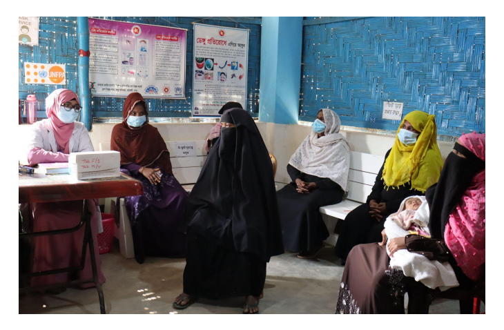
Women and pregnant mothers inside a health facility receiving counselling on reproductive health services