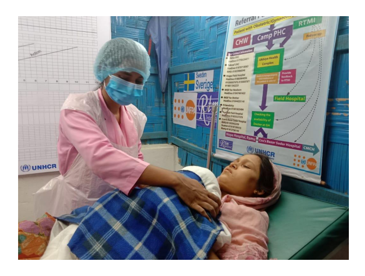
A midwife conducting a Post Natal Care (PNC) checkup inside a health facility