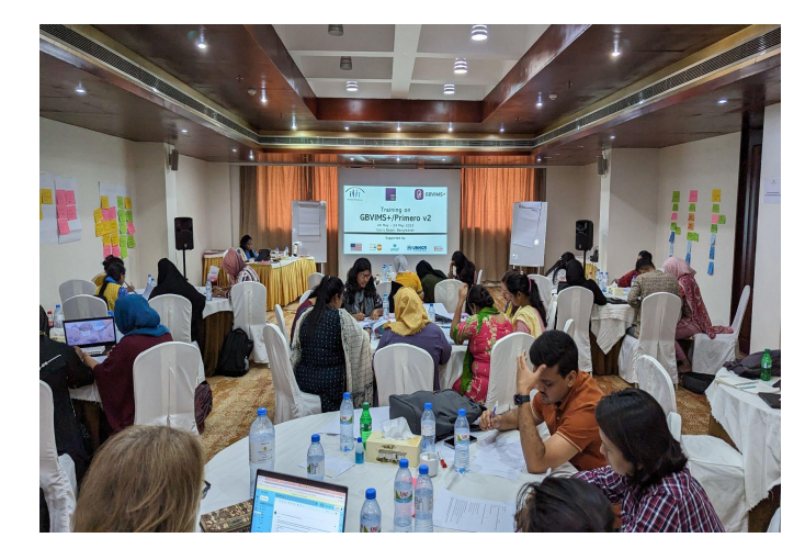
During a training, participants having practical session on filling out the intake form of an individual survivor case

During cyclone Mocha's landfall, Camps 11, 18, and 26 were severely affected. Three Women-Led Community Centers and nine Women Friendly Spaces suffered minor damage. In collaboration with GBVSS partners, the Dignity Kits Task Team distributed 491 Dignity Kits. 1,202 refugees, including 186 people with disabilities, received basic psychological first aid and awareness training.