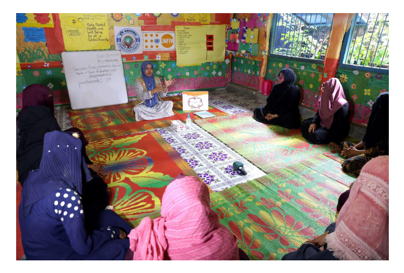
A session on GBV awareness at one of the UNFPA supported Women Friendly Spaces (WFS)/Shanti Khana/UNFPA Bangladesh