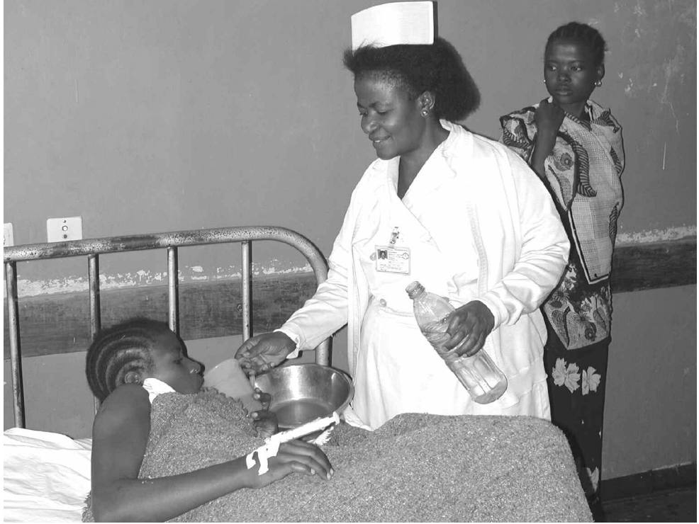
After the operation, the patient rests in bed for two to 14 days. Good postsurgical nursing care is essential to successful outcomes.

After the operation, the patient rests in bed for two to 14 days. (The protocol varies according to the surgeon; the postsurgical hospital stay is an issue of ongoing discussion and study.) Although the surgery is obviously of critical importance, good nursing care is essential, especially in the postoperative period. Often, without proper postoperative care, the repair may break down. Because the patient is still using a urinary catheter and has a contracted bladder (her bladder has not been used for storage of urine since the fistula occurred), any stretching of the bladder by retained urine may cause the fistula to reopen. Along with providing good wound care, nurses must monitor catheter drainage to ensure that no blockage occurs, and they must supply patients with large amounts of fluids and appropriate nutrition during their rehabilitation.