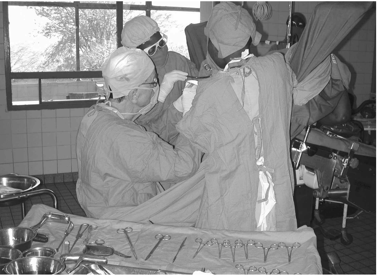
Fistula repair surgery requires from one to seven hours. The hospital is slowly building local expertise but still relies on visiting surgeons to perform about half of all repairs. Dr. Kelly (above) spends about six weeks each year at Bugando Medical Centre.

Surgical fistula repairs may take from one to seven hours. Simple operations, carried out under spinal anesthesia, involve the dissection of scar tissue and suturing of the tear; occasionally a fat graft is made in order to increase the blood supply to the repair site. Procedures that are more complicated require general anesthesia and may involve abdominal ureteric reimplantation into the bladder or ileal conduit procedures (in which the bladder is removed, and a segment of the small intestine is removed and transformed into a channel connecting the ureters to an abdominal stoma).