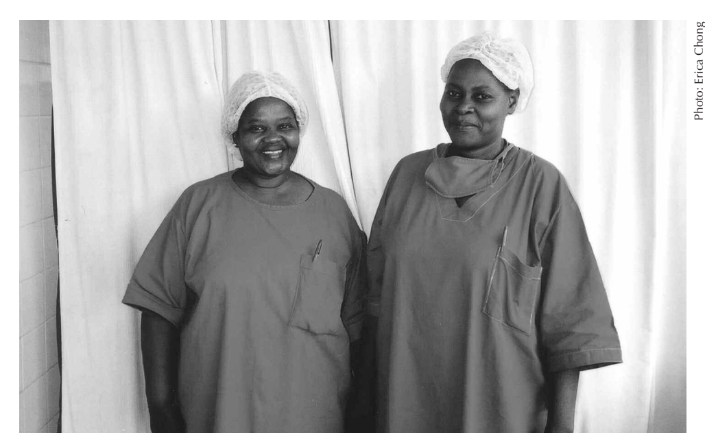
Working on the fistula ward is difficult and is a voluntary assignment. Nevertheless, the project attracts dedicated nurses, and turnover is low.

Expanding capacity allows the project to serve more women, but has