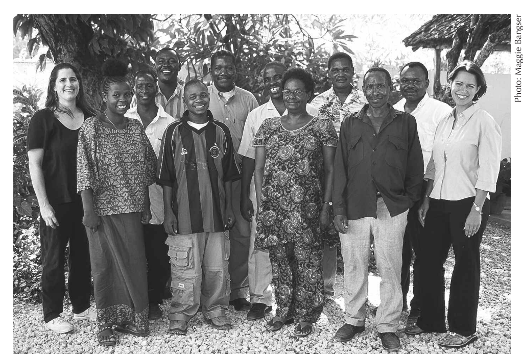
The staff of the Women's Dignity Project

A girl or woman with fistula is unlikely to understand what has happened to her or realize that an effective treatment exists. Accordingly, the network of organizations working on fistula has used a wide range of avenues to educate peo-