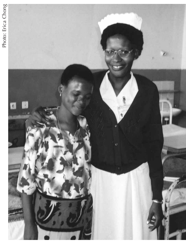
With adequate surgical staff and facilities, the great majority of fistulae can be successfully repaired or dramatically improved.

The research is uncovering such invisible factors as the opportunity costs of leaving home, a pattern whereby poor people receive treatment last; the absence of emergency community transport systems; and a lack of awareness among family decisionmakers (largely husbands and mothers-in-law) about the need to delay marriage and childbearing and to seek emergency medical care during prolonged labor. The findings will be used to develop locally appropriate ways to prevent and manage fistula throughout Tanzania by cooperating with communities and health-care providers. In a second study, the Women's Dignity Project is examining poor women's experiences of health-care services, including the impact of users' fees, barriers to access, and overall quality of care.