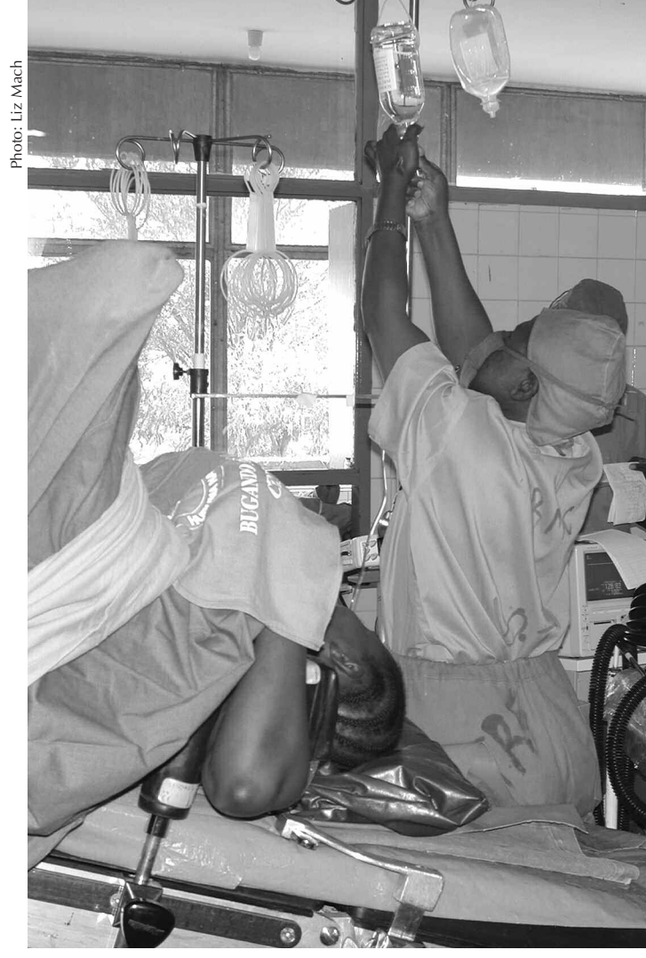
As part of building capacity to provide surgical repairs, nurses learned pre- and post-operative procedures, case management, proper use of instruments and solutions, and patient counseling.

To learn about their patients' needs and experiences, the project also carried out a small qualitative study among its first 50 patients, those who arrived at Bugando between August and October of 1997. The patient profile-at least among this small sample—is characterized by early childbearing, poverty, and inadequate access to skilled health care. For example, more than three-fourths of them were 20 or younger when they first became pregnant, and fewer than 12 percent were assisted by a trained health worker during childbirth. The majority of fistula patients paid $9 for transportation to the hospital, equivalent to about 5 percent of the annual gross national product per capita in Tanzania.