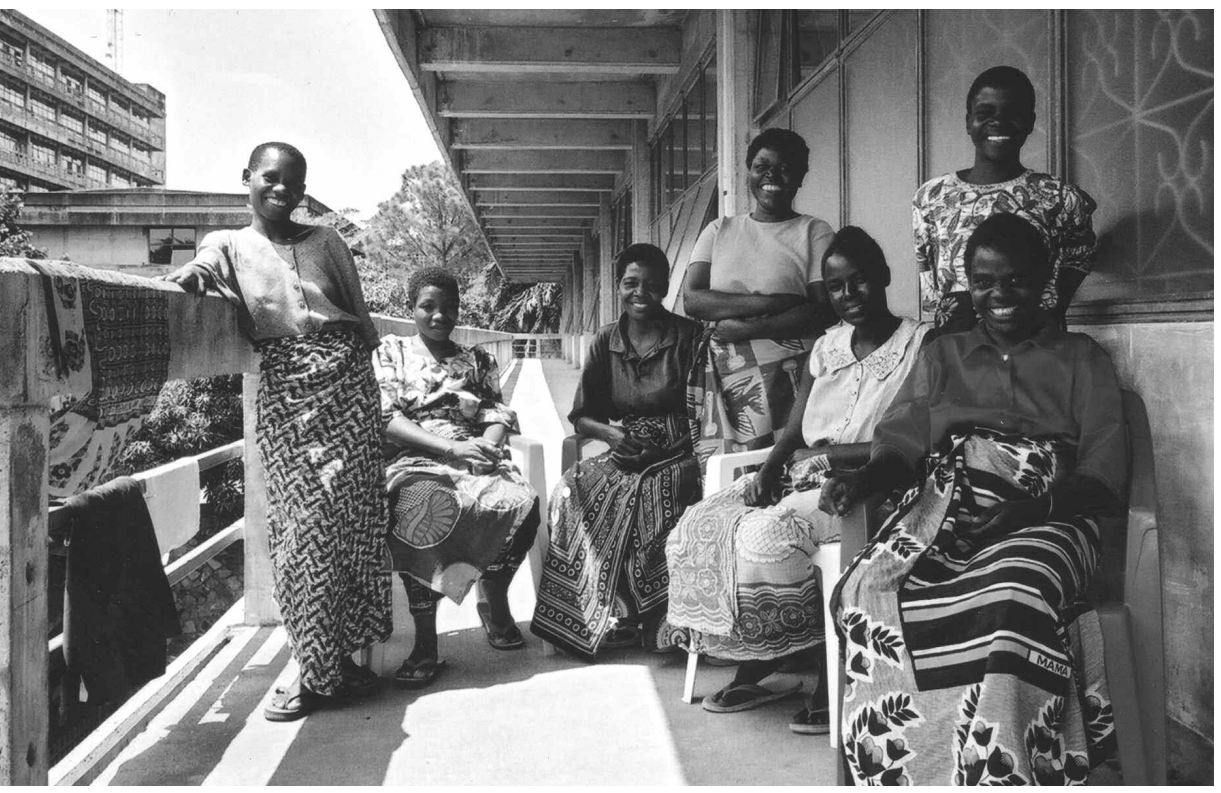
The fistula ward is a safe haven for the patients there. For many, this may be the first time since developing a fistula that they have found acceptance and been treated with dignity; the opportunity to commiserate over the loss of a child or the abandonment by a husband provides critical support.

healing process by acting as counselors. They are keenly aware that these patients may be experiencing multiple losses-of child, husband, reproductive ability, livelihood, self-esteem, and social status-and that they need time to grieve and talk. At the same time, the nurses also guide the fistula patients to start thinking about their time at Bugando and about their futures. They help patients clarify their needs, concerns, hopes, and expectations. Some patients (particularly the younger ones) become so attached to the nurses that the nurses function as their surrogate mothers or older sisters. In a further effort to humanize care and reduce fear, the anesthesiologist routinely meets with each woman before her surgery so that she will see a familiar face in the operating room.