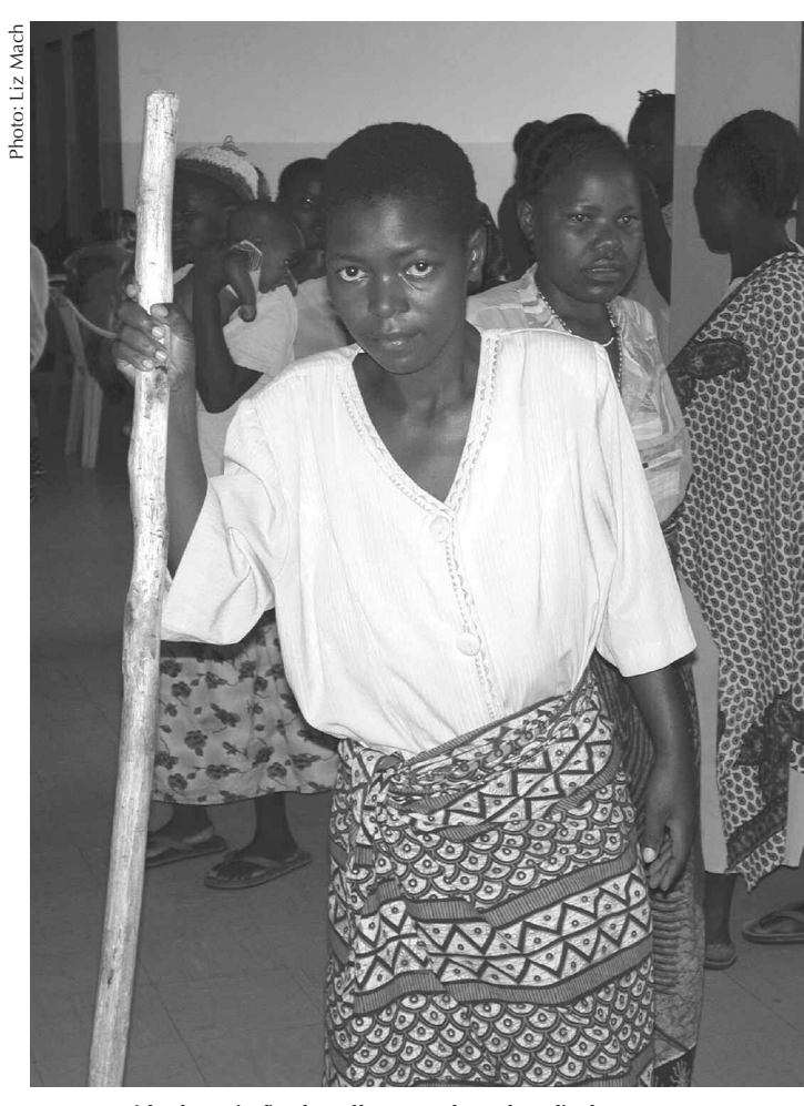
Women with obstetric fistula suffer a number of medical consequences, including incontinence. The social ramifications, however, may be even more traumatic, often involving the loss of social and economic support systems, in addition to the death of the baby in childbirth.

growth and increase the risk of obstructed labor. Similarly, girls who are married young, often for economic reasons, frequently become pregnant before completing their own growth. Older women who have been weakened by