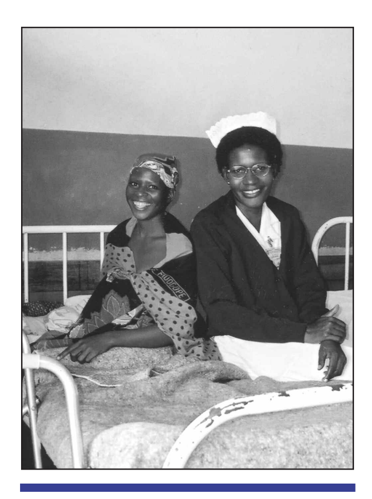
Healing Wounds, Instilling Hope: The Tanzanian Partnership Against Obstetric Fistula