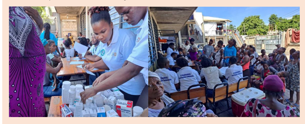
Mobile clinic activities supported by UNFPA in displacement site, Port-au-Prince