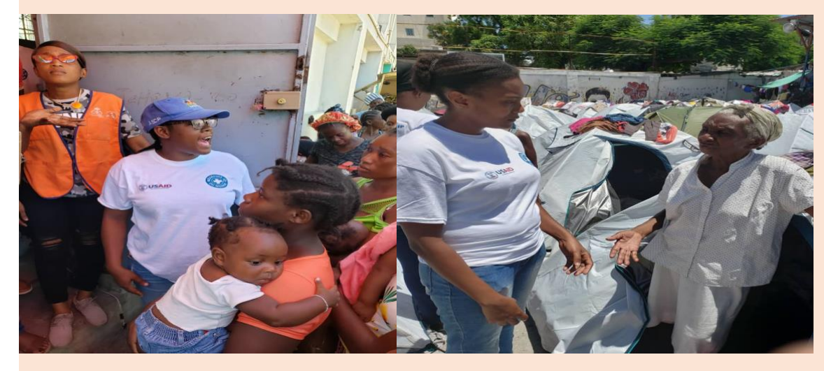
Carrefour-Feuilles displacement sites. Awareness raising on GBV services with outreach officer and case workers from MDM GBV Mobile team