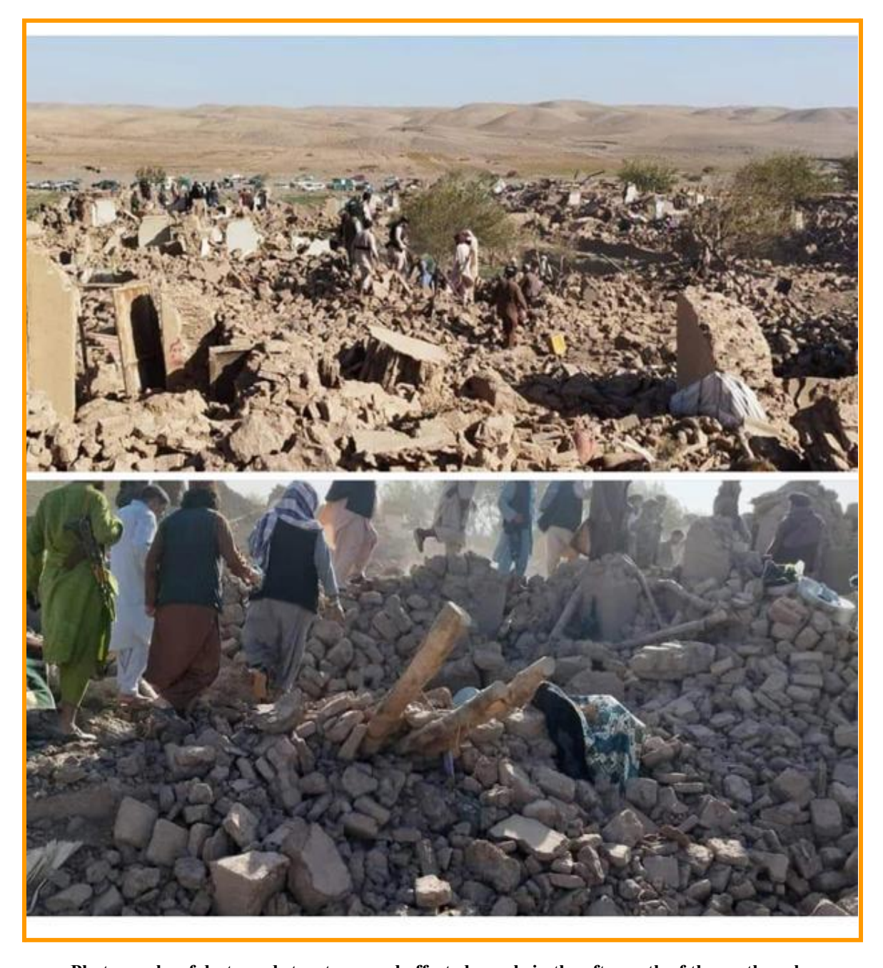
Photographs of destroyed structures and affected people in the aftermath of the earthquake.

• The number of affected people stands at 4,200, including 1,400 internally displaced persons who have sought refuge in Herat City, where they are currently residing in abandoned buildings. Search and rescue operations are ongoing, with concerns that more individuals might be trapped beneath collapsed structures.