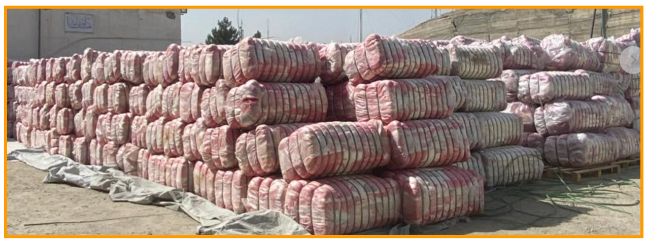
With winter drawing near, blankets and tarpaulin sheets are prepared for distribution among affected women and girls, as a supplement to the Non-Food Item relief efforts.