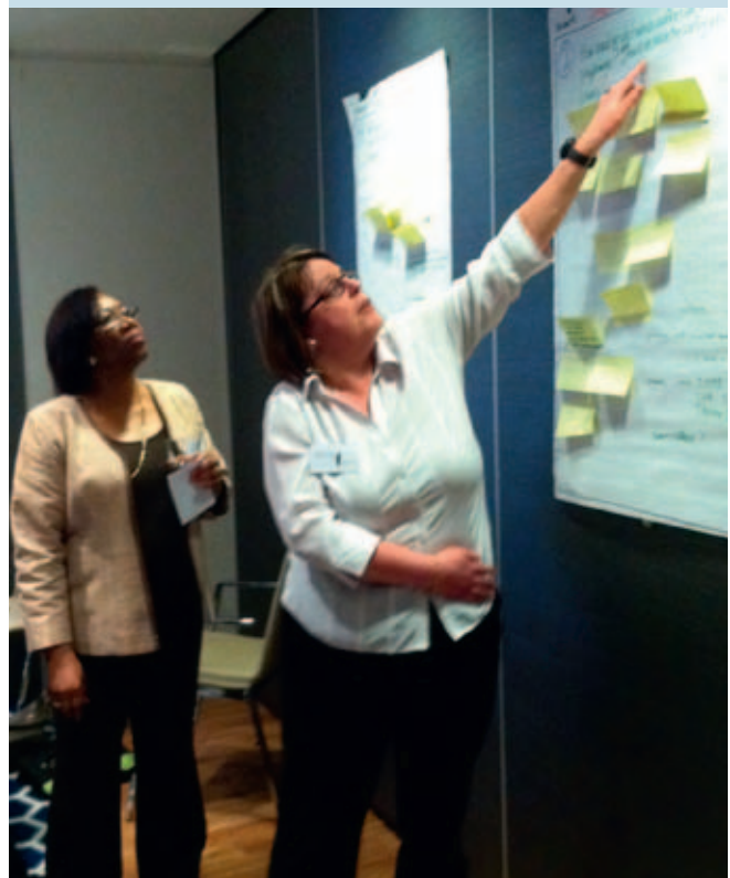
Answering questions posted about the GRPHCS.

About the method: An interactive approach called “crowd sourcing in pairs” captured the ideas of all participants, without identifying the source as representing government, NGO, staff, etc. The group was asked to imagine the new programme. What would it look like? Participants worked in randomly selected pairs to answer questions on nine posters, writing on sticky notes. This was followed by analysis in groups of four (quads). Each small group then presented in plenary, reporting on the patterns they found in their analysis of response. Reflections were discussed in plenary and summary comments were provided by a selected representative.