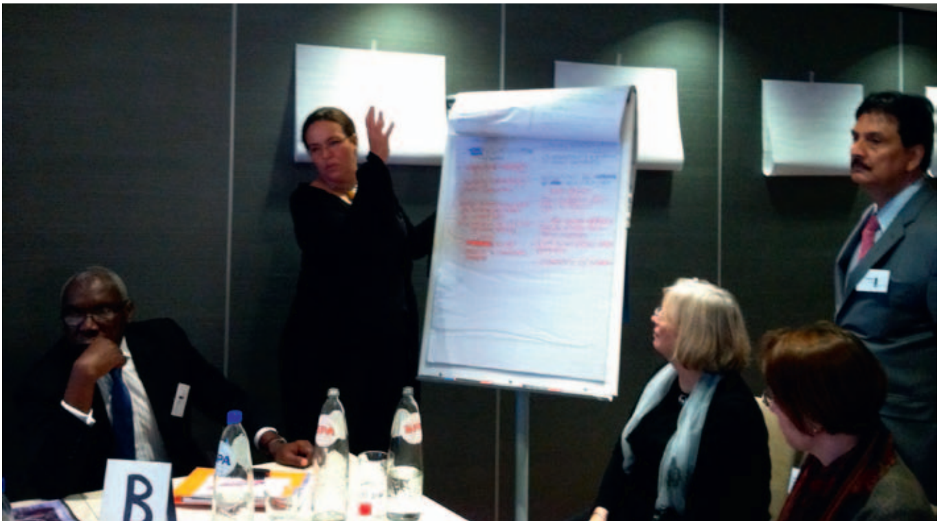
The meeting confirmed support for continuing the programme.

The GPRHCS Phase II will, based on partner feedback, provide support in 69 countries. Changes in technical assistance modality to countries are anticipated. The focus will be similar to Phase I but stepped-up in 35