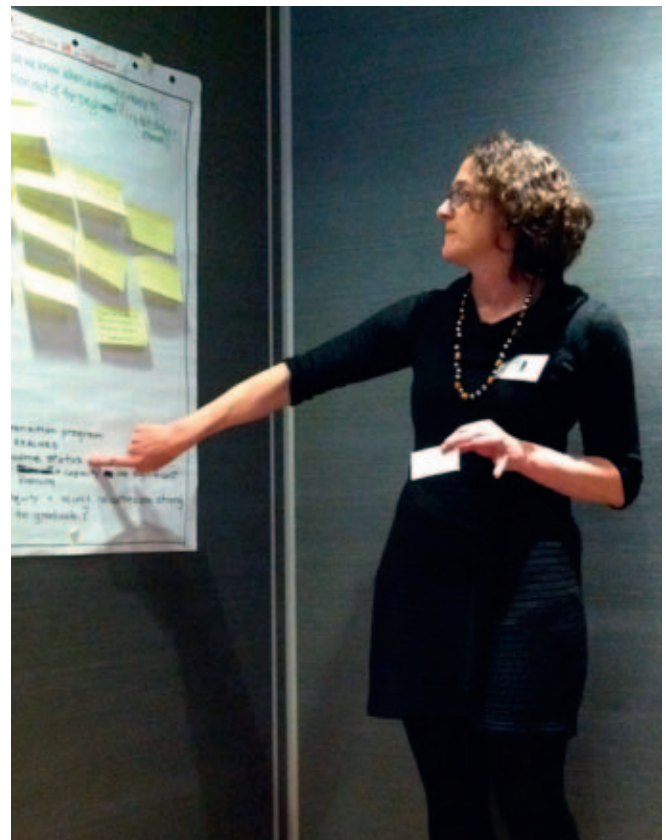
Participants reported to the group with a summary of comments.