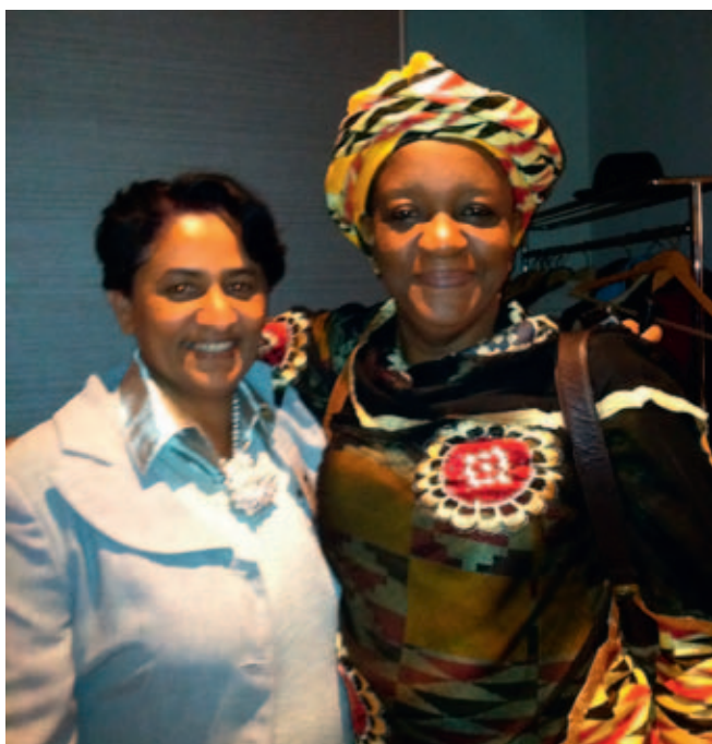
The Hon. Johanita Ndahimananjara (left) and the Hon Zainabu Hawa Bangura (right).

From Sierra Leone, the Hon. Zainabu Hawa Bangura described a successful effort to improve accountability and monitor supplies through a contract with a civil