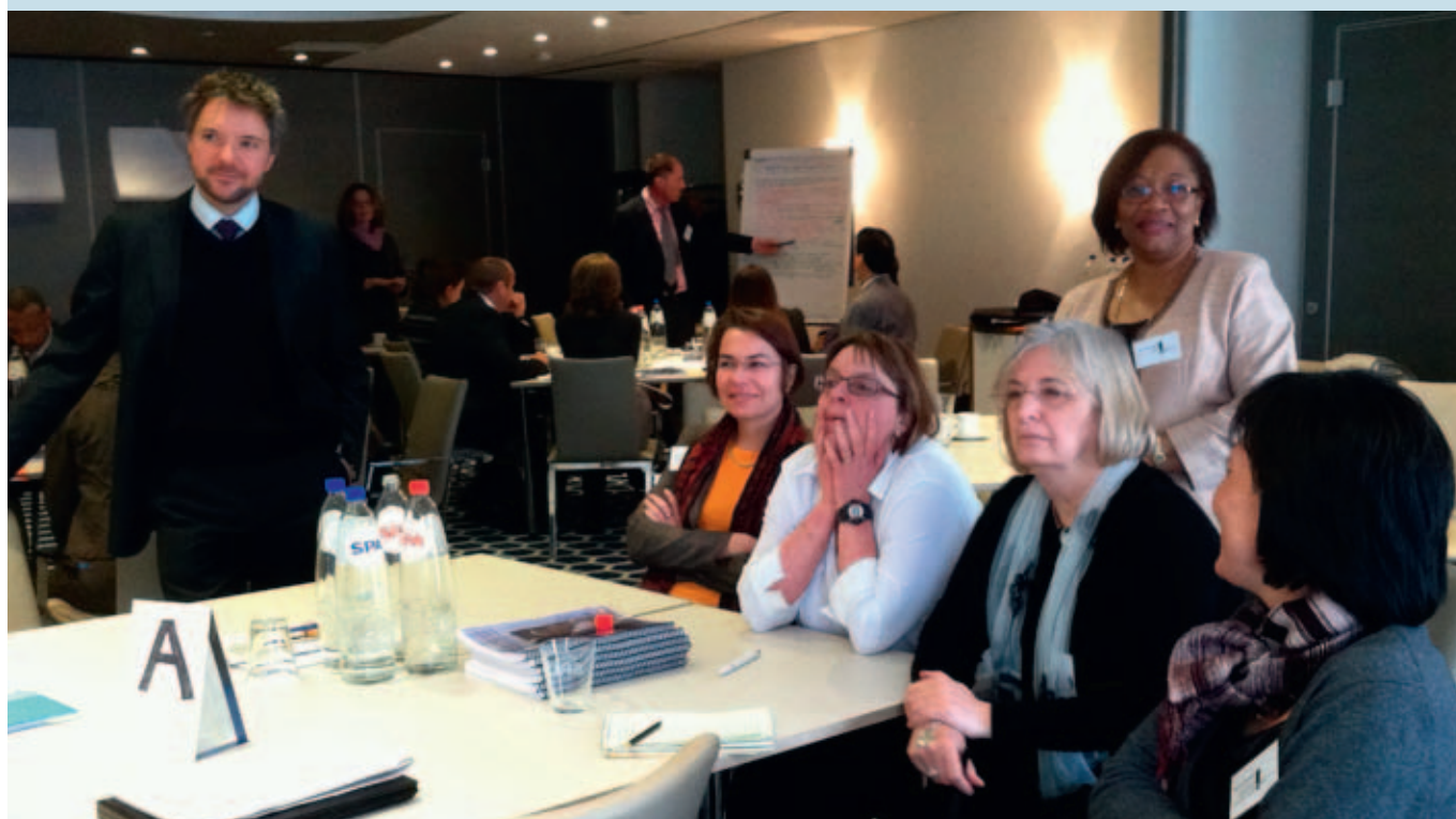
Group work at the Fifth Stocktaking Meeting of the GPRHCS.

on RHCS, held in September 2011 in New York. These presentations, in combination with the morning sessions, set the scene for an interactive session involving all participants. The interactive session was built around a series of questions and was effective in giving participants the opportunity to provide feedback about key elements of the GPRHCS Phase II design, objectives and operational modalities. The second day of the event focused on the commitment of financial resources and political will for supporting RHCS. Ministers of Health from Madagascar and Sierra Leone described the process of accelerating access to family planning in their respective countries. A panel discussion addressed the role of partners. The meeting concluded with consensus on the way forward.