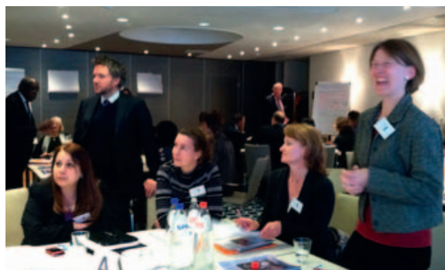
Small group work on GPRHCS issues.