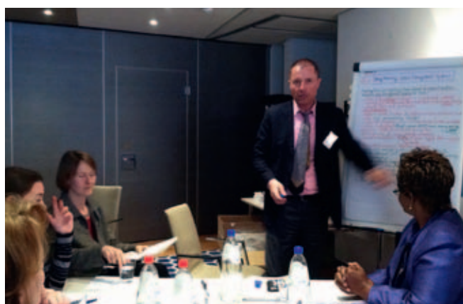
Capturing ideas on flip charts.