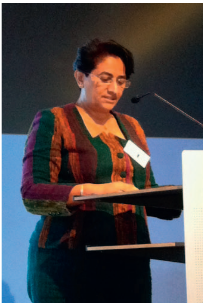
The Honorable Johanita Ndahimananjara, Minister of Health, Madagascar.

The country's interim action plan for 2012-2012 builds on the commitment of national and regional stakeholders for family planning; active collaboration with partners, and decentralization of maternal health, family planning and logistics activities. GPRHCS has supported the integration of RH commodities into