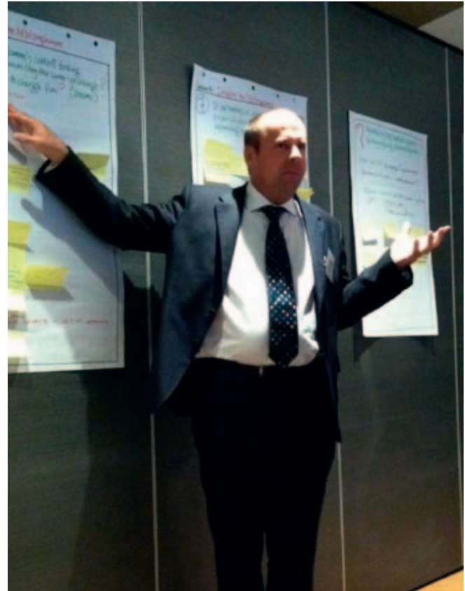
The posters collected input from donors, partners and staff alike.