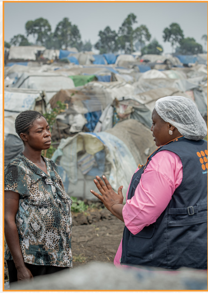
midwife with and pregnant woman in the Bulengo IDP site