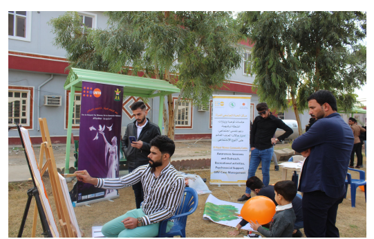
Engaging men for equality