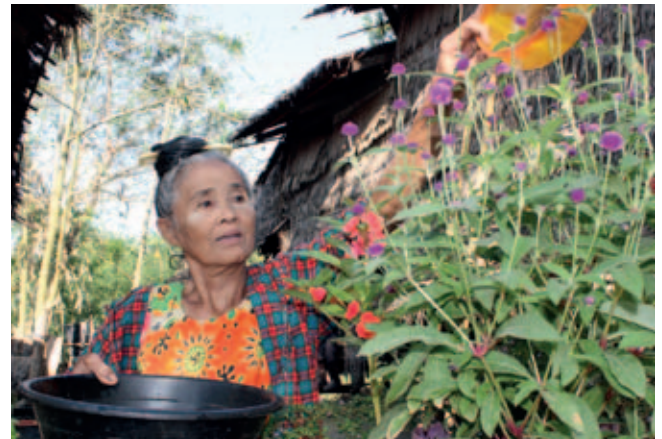
Growing flowers for sale in Myanmar.

In order to realize their right to enjoy the highest attainable standard of physical and mental health, older persons must have access to age-friendly and affordable health-care information and services that meet their needs. This includes preventive, curative and long-term care. A lifecourse perspective should include health promotion and disease prevention activities that focus on maintaining independence, preventing and delaying disease and disability, and providing treatment. Policies are needed to promote healthy lifestyles, assistive technology, medical research and rehabilitative care.