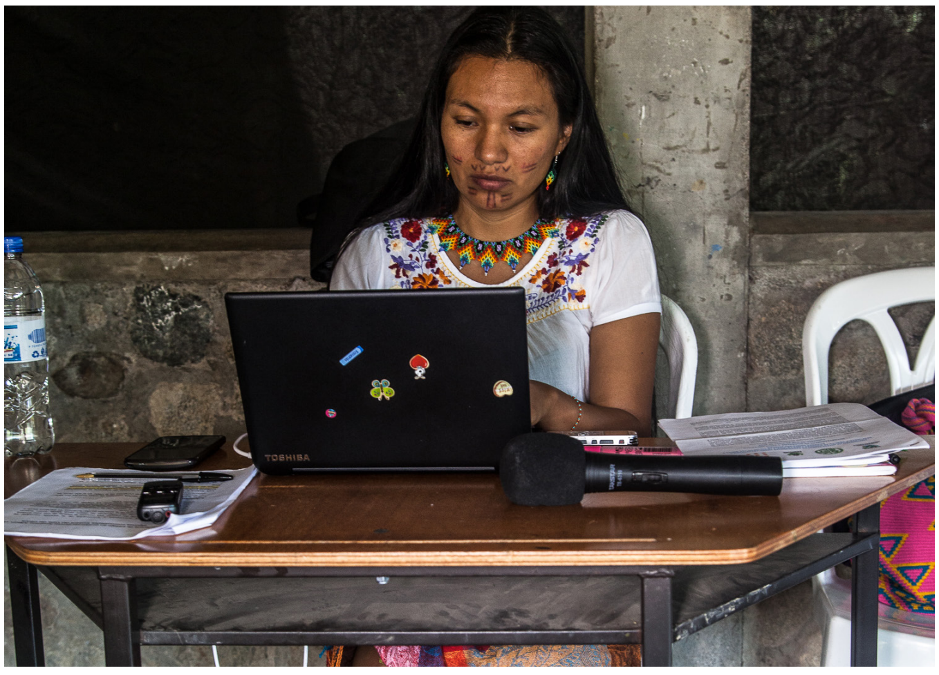
UNFPA Latin America and the Caribbean

Despite progress, accountability to survivors of TF GBV through law and policy remains a challenging area to address. Existing legal frameworks are often insufficient and lag behind rapidly evolving technology and emerging forms of violence. Even though there is growing recognition of TF GBV as a form of discrimination that violates a range of human rights and freedoms, including the rights to access information and participation; to a life free from violence; to freedom of expression; to privacy; and to participate in public and political life, available evidence highlights an important structural gap in accountability mechanisms. There is a high rate of failure by law enforcement to implement appropriate corrective measures to tackle TF GBV (UNFPA, 2021a; The Economist Intelligence Unit, 2021).