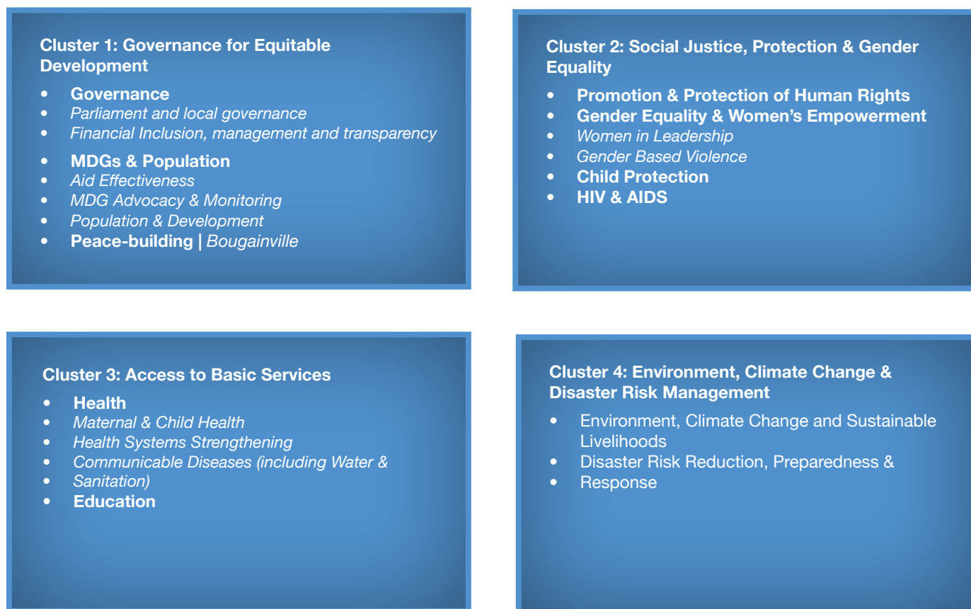
Figure 4: UNDAF 2012-2015 clusters

Given the slow progress on the MDGs and in response to the key national frameworks, in particular nine out of ten cross-cutting issues identified in the MTDP 2011-2015, the overarching goal of the new UNDAF 2012-2015 is "Supporting PNG to accelerate MDG achievement". The programme will be focused around four clusters: