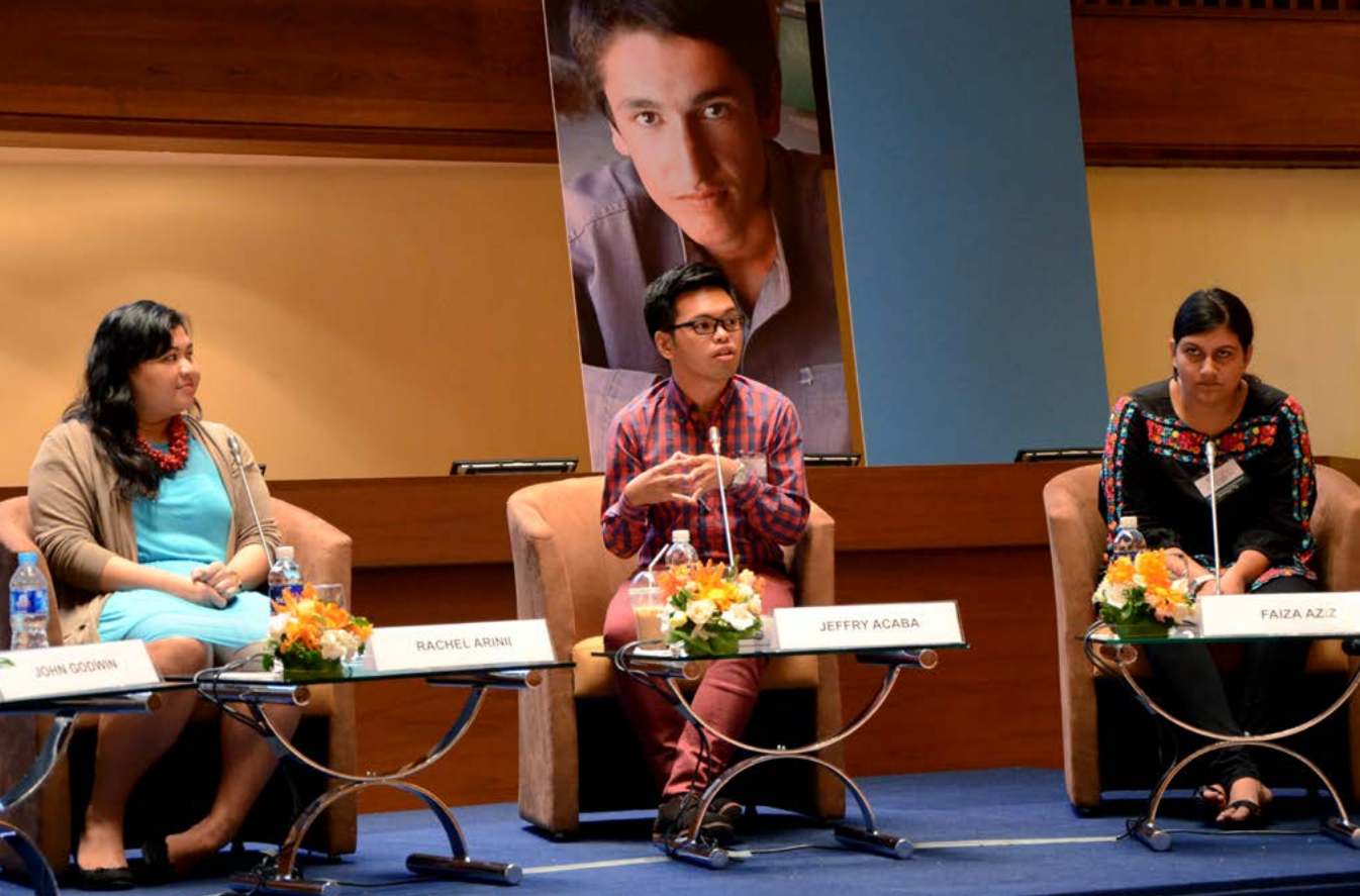
Youth at the side event on “Young people’s access to sexual and reproductive health and HIV services: what’s law got to do with it”, organized by the RCM-UNDG Asia-Pacific Thematic Working Group on Youth.

including long-term care for older persons. In that regard, they stressed the need to adapt health and social systems in response to the rising demand for elder care and support, with particular attention to the specific needs of older women.