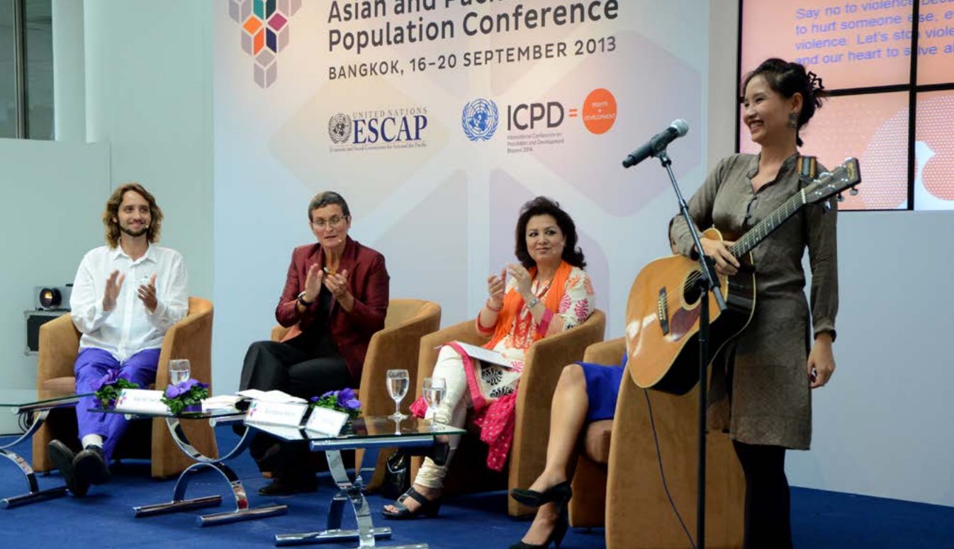
Stakeholders at the side event on ending violence against women and girls, organized by the RCM Asia-Pacific Thematic Working Group on Gender Equality and the Empowerment of Women.

improvements in the sexual and reproductive health of women and girls were a factor in gender equality gains in such areas as education, employment and social participation.