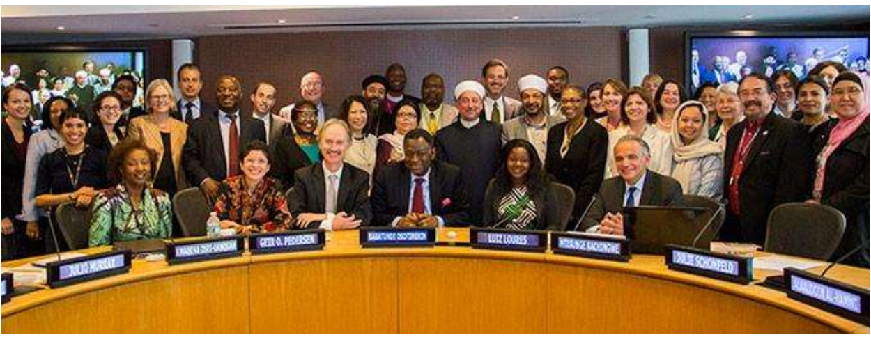
Faith leaders at United Nations urge action on sexual and reproductive health and reproductive rights.

The statement repudiates abuses, often thought to be based in religion, that undermine human rights. "Not in our name should any mother die while giving birth," it says. "Not in our name should any girl, boy, woman or man be abused, violated or killed. Not in our name should a girl child be deprived of her education, be married, harmed or abused. Not in our name should anyone be denied access to basic health care, nor should a child or adolescent be denied knowledge of and care for his/her body. Not in our name should any young person be denied their full human rights."