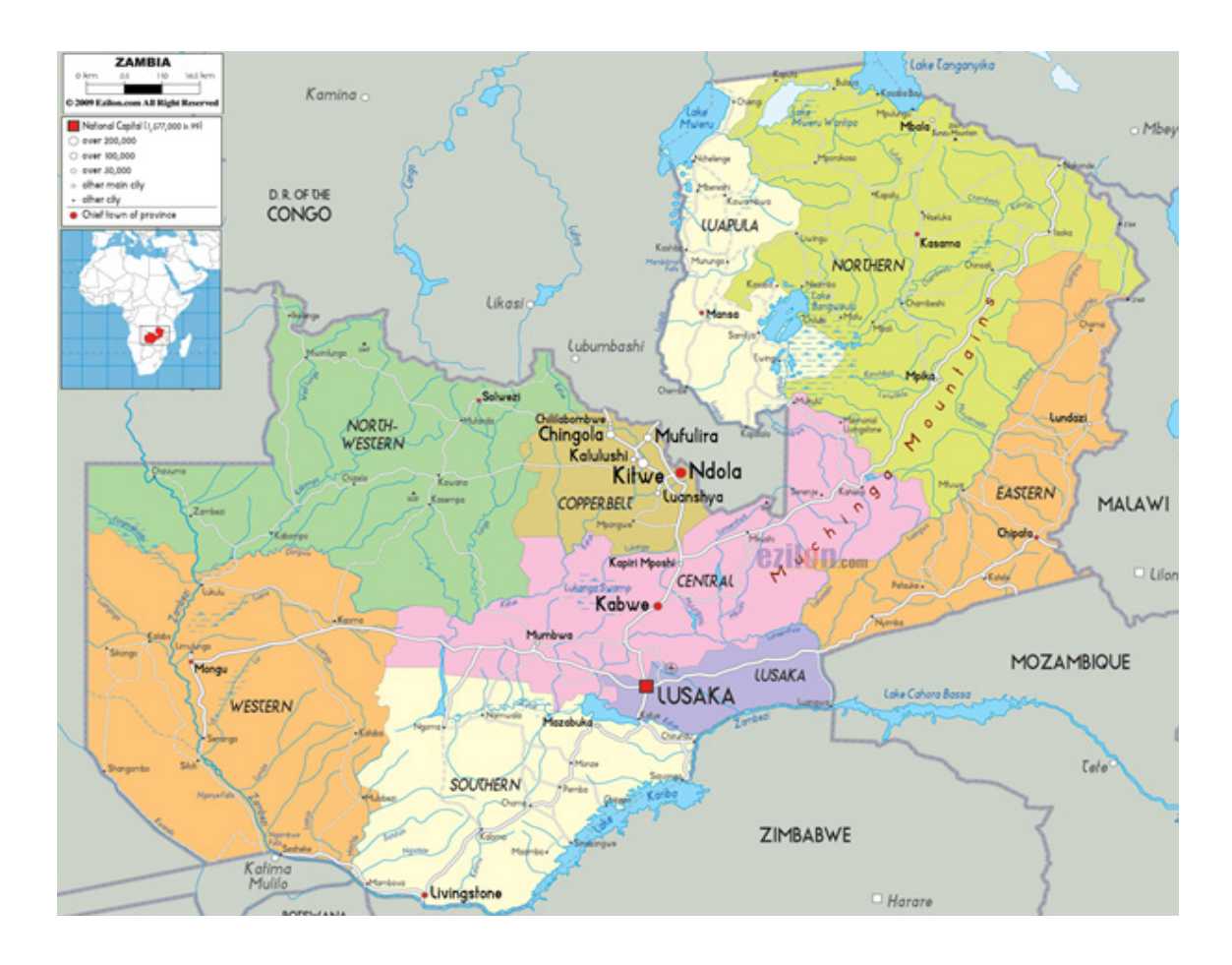
Figure 2: Map of Zambia