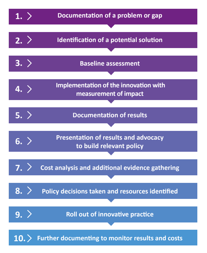
Figure 5: The innovation to policy and scale-up process

Although H4+ promoted a practical definition for innovation (see 4.4.1), it did not have a systematic process or model in place to support the innovation process. Ideally, this process would include the full cycle of innovation, with all the stages shown in Figure 5 below. It is unrealistic to expect H4+ to document every programme innovation according to this cycle, especially given the relatively short time frame for programme implementation. However, the cycle provides a roadmap to indicate where documentation exists and where there may be gaps to support an understanding of the programme implications for future replication and scale up of a specific innovation.