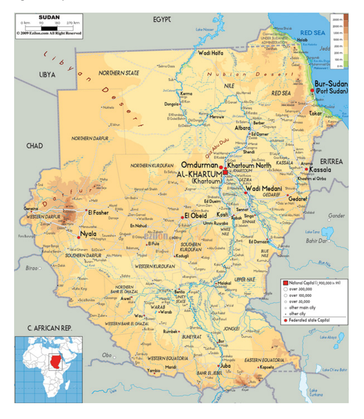
Figure 2: Map of Sudan