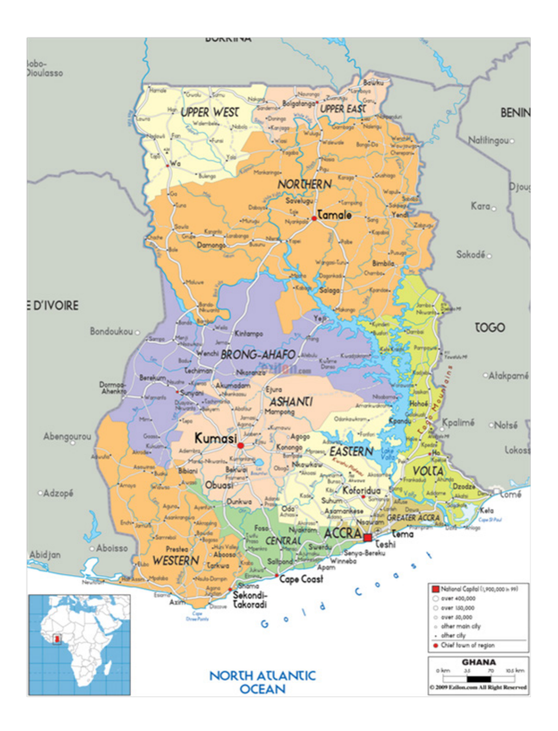
Figure 2: Map of Ghana