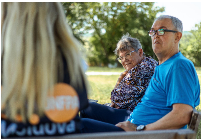
UNFPA Safe Spaces provide a lifeline to refugees with disabilities in Moldova through support and belonging.

People reached with SRH information, referrals and services