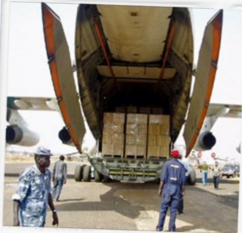
UNFPA procured 15 million USD worth of goods and services for Sudan's census. Pictured above is one of the nine Antonov cargo airplanes UNFPA contracted to transport goods procured for the Sudan census.

Sudan posed a number of procurement and logistical challenges. The delivery of goods from the North and South of Sudan proved to be difficult as some suppliers could only deliver to Port Sudan, and bad road conditions made inland delivery to Juba an obstacle.