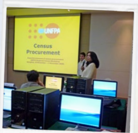
UNFPA PSB conducting a Census Workshop

UNFPA Procurement Services Branch , with years of extensive experience, is a leader in the procurement of census goods and services, and partners with governments to provide planning, procurement and logistical services that ensure a successful census operation.