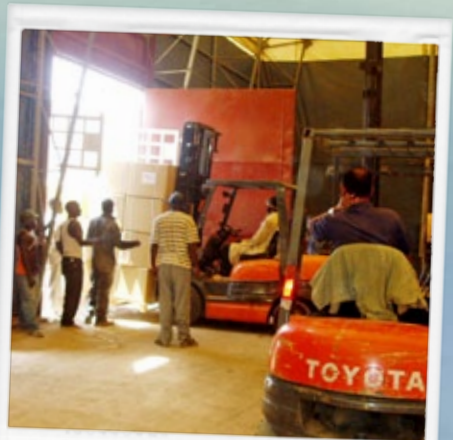
Warehousing, packing and dispatching operations for the Sudan Census