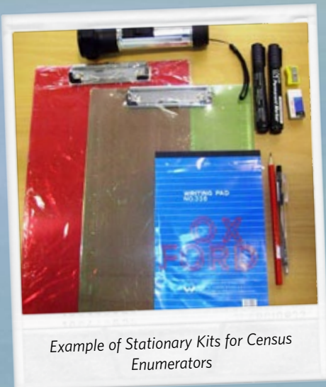
Example of Stationary Kits for Census Enumerators

UNFPA provided technical assistance, such as the design of questionnaires and related software solutions,