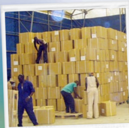
Warehousing, packing and dispatching operations for the Sudan Census

However, UNFPA PSB was able to meet these challenges and support Sudan in implementing a successful national census by providing the following expertise: