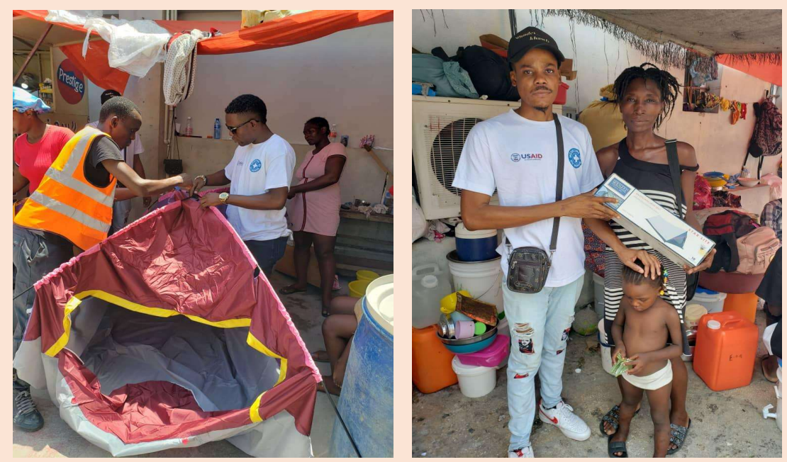
UNFPA partner, MDM, distributed individual tents and solar lamps in a displacement site in Port-au-Prince