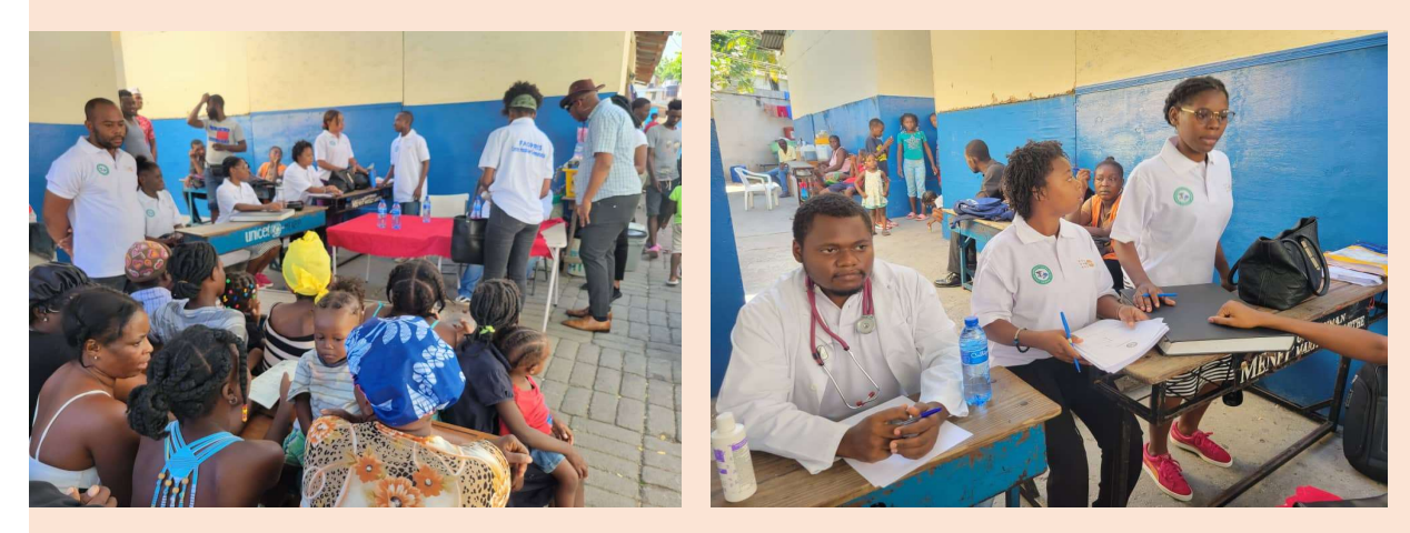
Mobile Clinic activities supported by UNFPA in displacement site, FADHRIS, Port-au-Prince